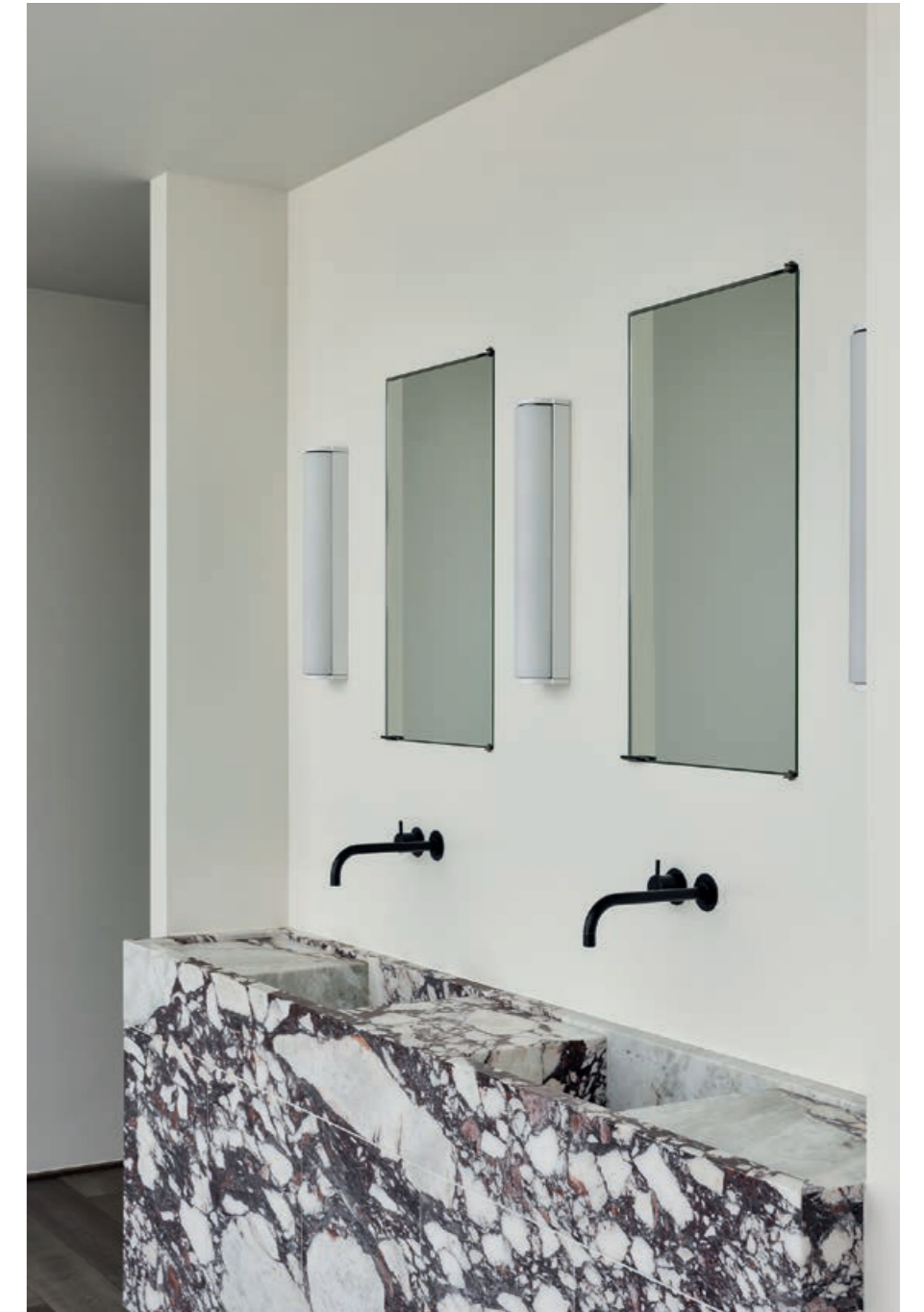
All natural stone works in this project with Calacatta Viola have been executed by G&M (Graniet & Marmer).