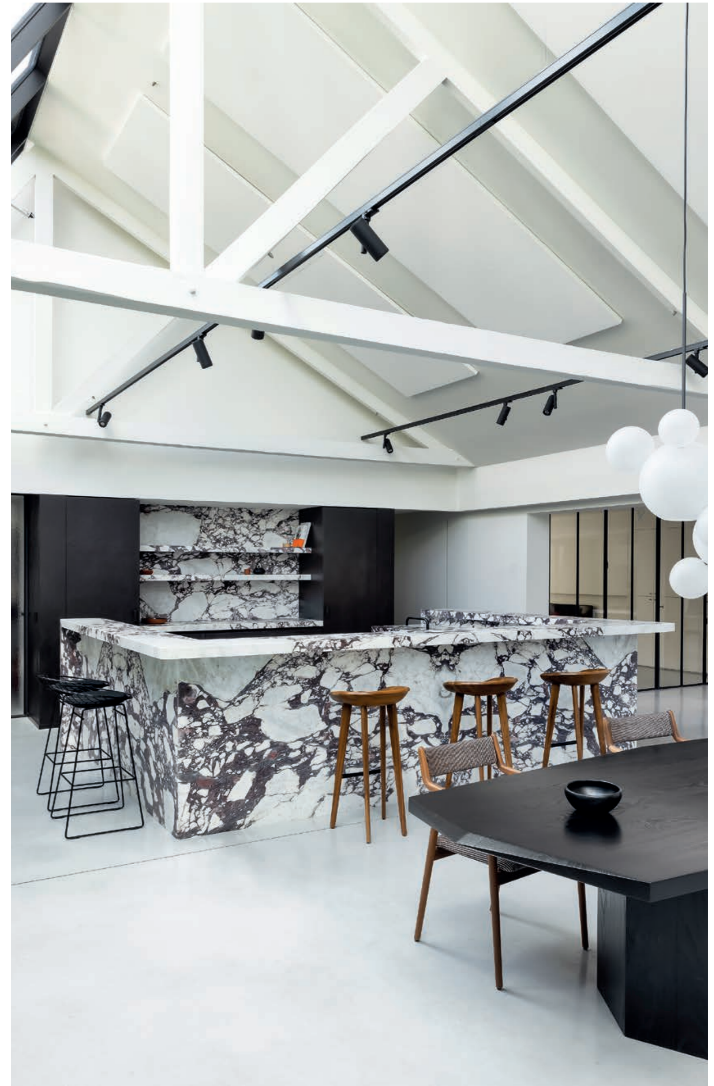
Pages 122 to 131: Calacatta Viola for this kitchen and bathroom designed by Arjaan De Feyter. The kitchen makes liberal use of calacatta viola stone for the island with a custom sink, backsplash, benchtop and shelving. The evocative stone commands attention on a canvas of ebony cabinetry painted using a "special paint technique" and white concrete floors.