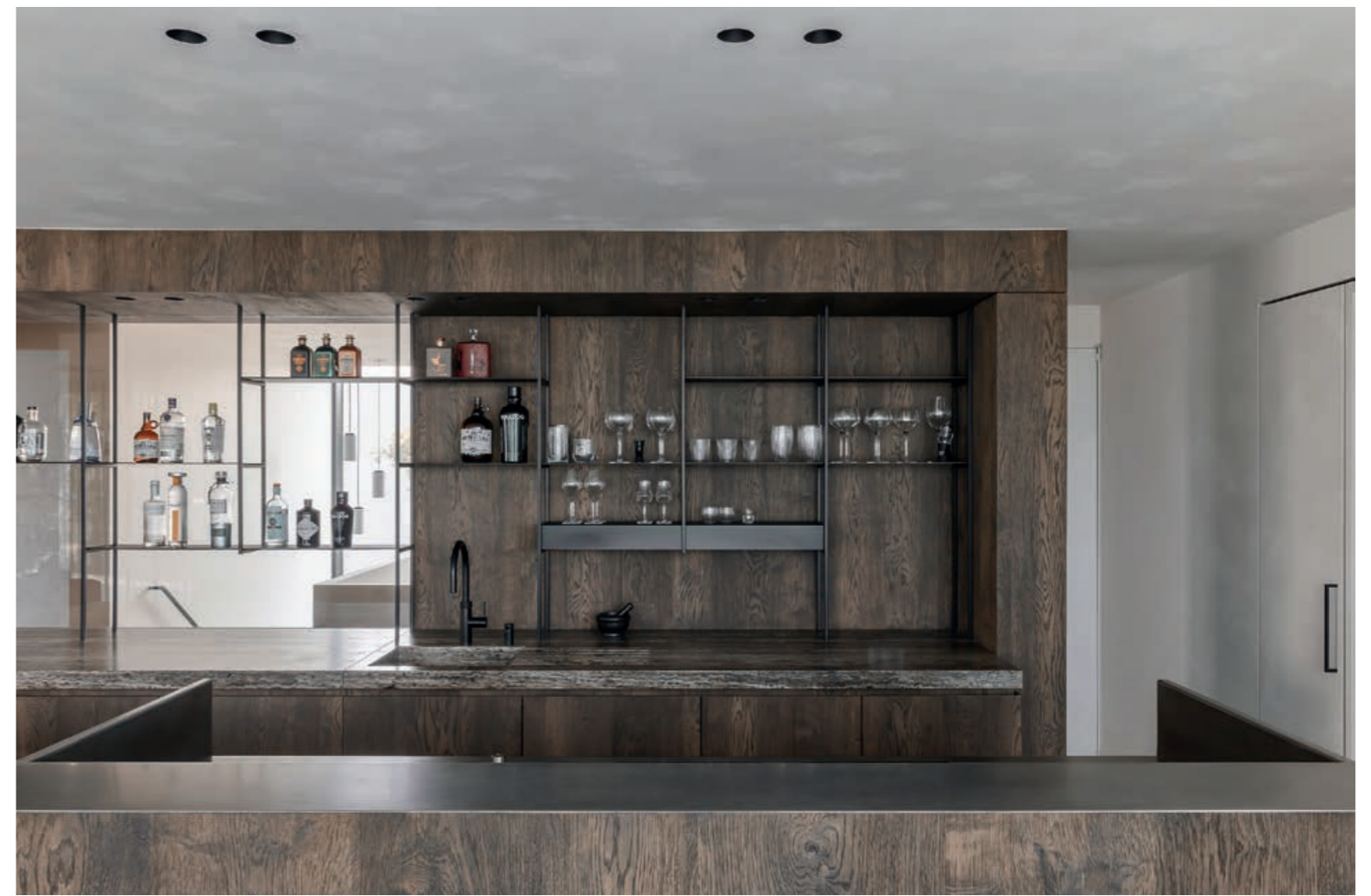
Pages 116 to 121: Van Den Weghe also delivered the stone for this residence: dark Travertin Titanium and white transparent Onyx stone.